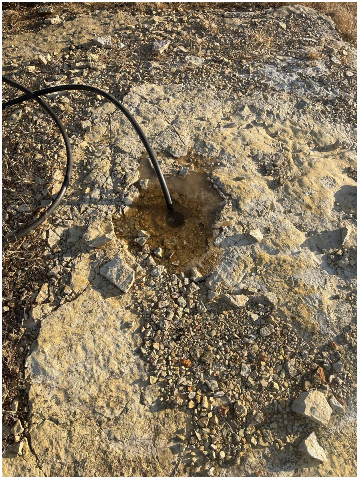
Backfilling EB-1; water rising to top of casing