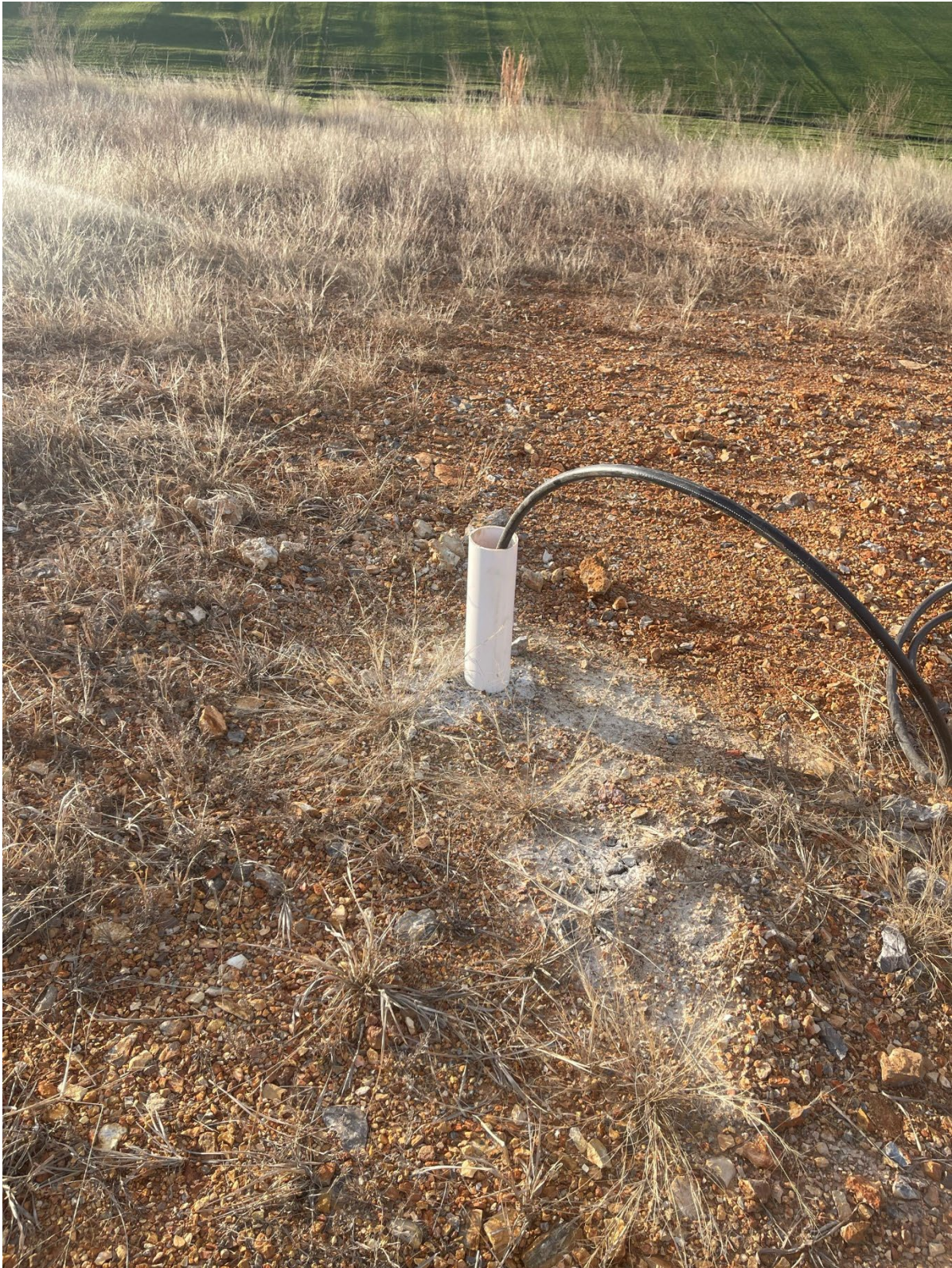
EB-2 with tremie pipe, prior to grouting