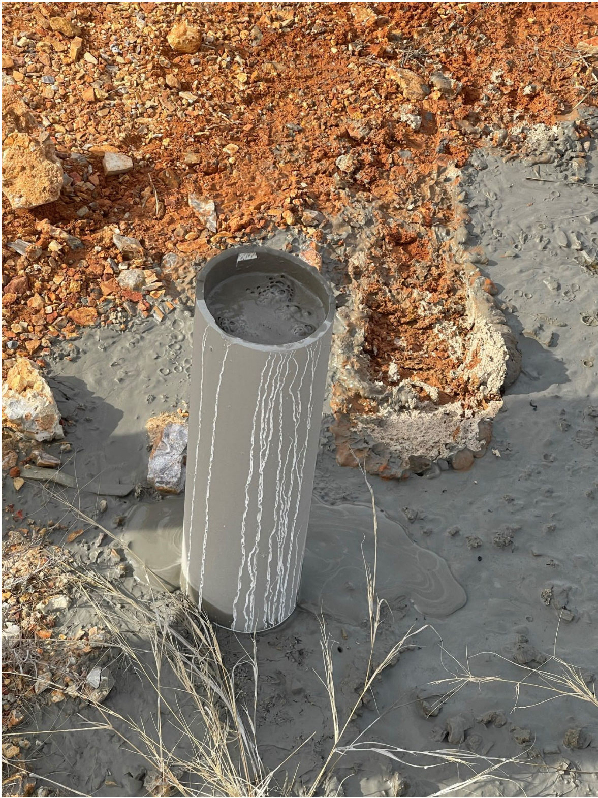
EB-2, backfill complete, prior to top off