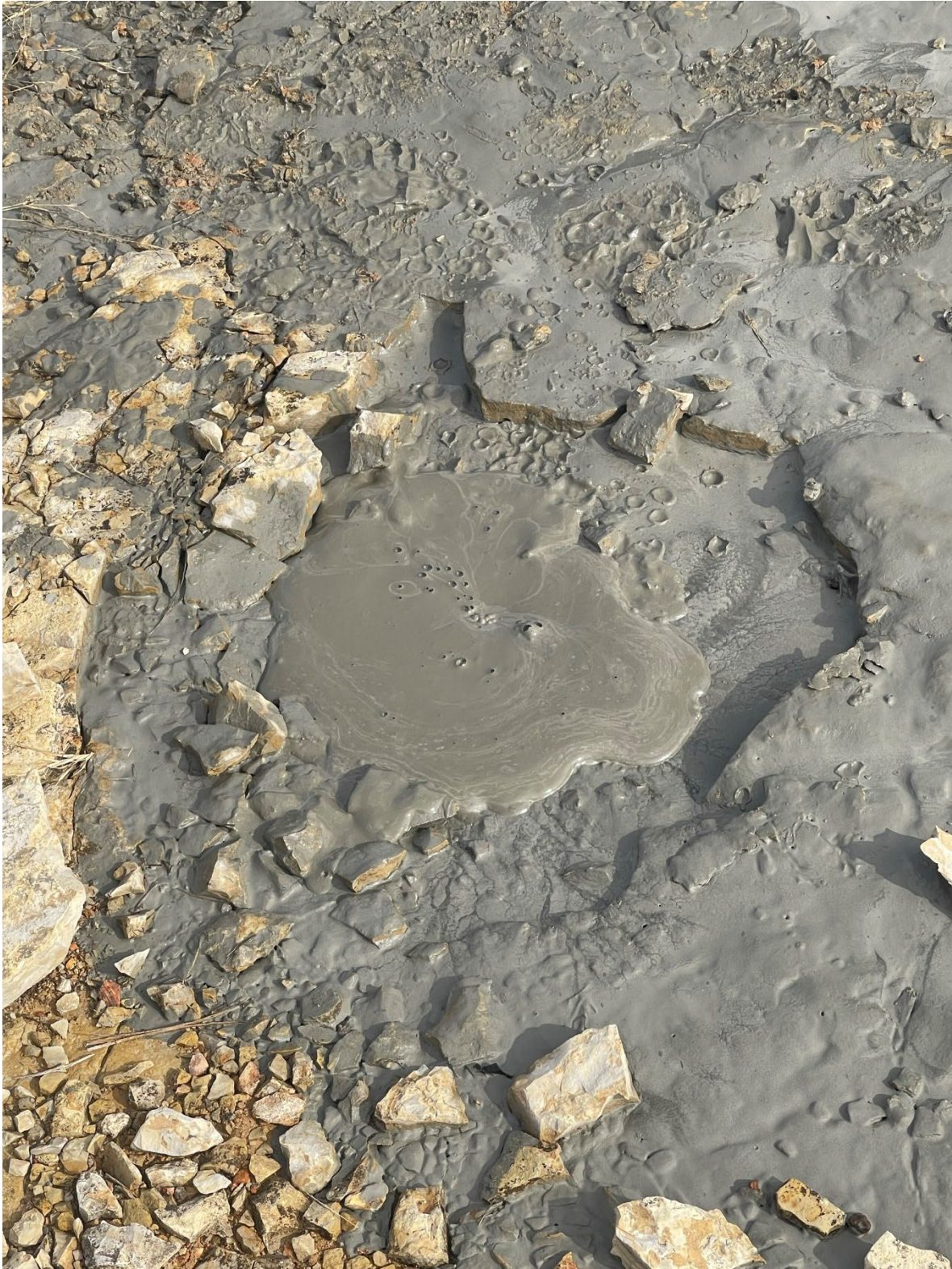
EB-1, backfill complete, prior to top off