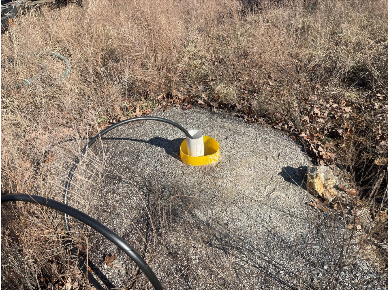
IW-1 with tremie pipe prior to grouting