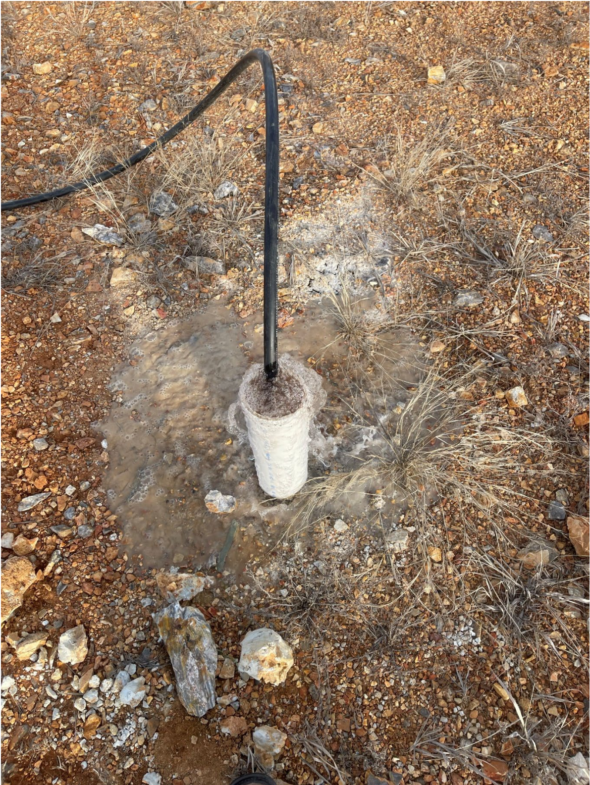
Backfilling EB-2; water rising to top of casing