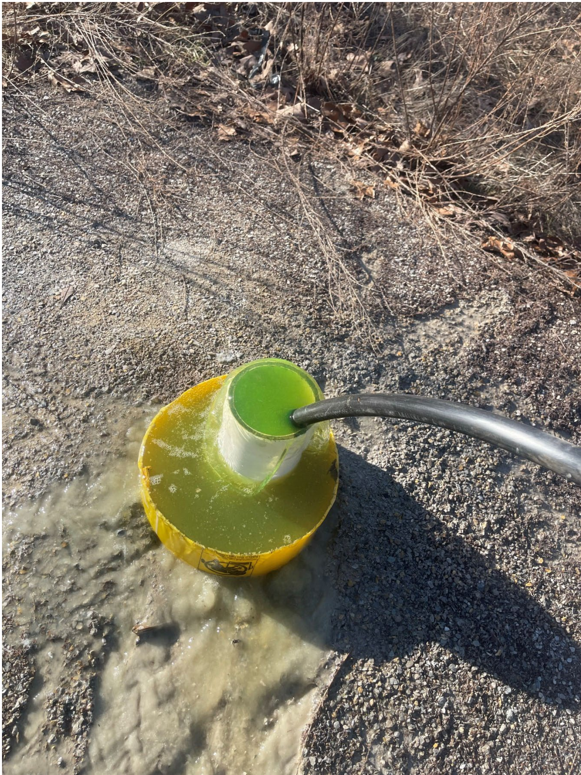
Backfilling IW-1; water rising to top of casing