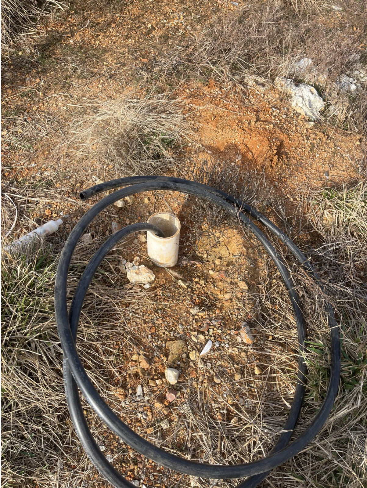
EB-5 with tremie pipe prior to grouting