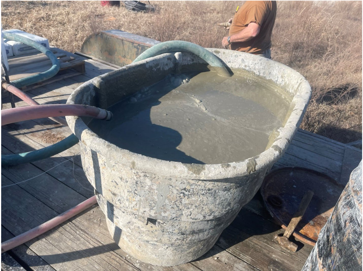
Vat of Portland cement to be used to grout boreholes through tremie pipe