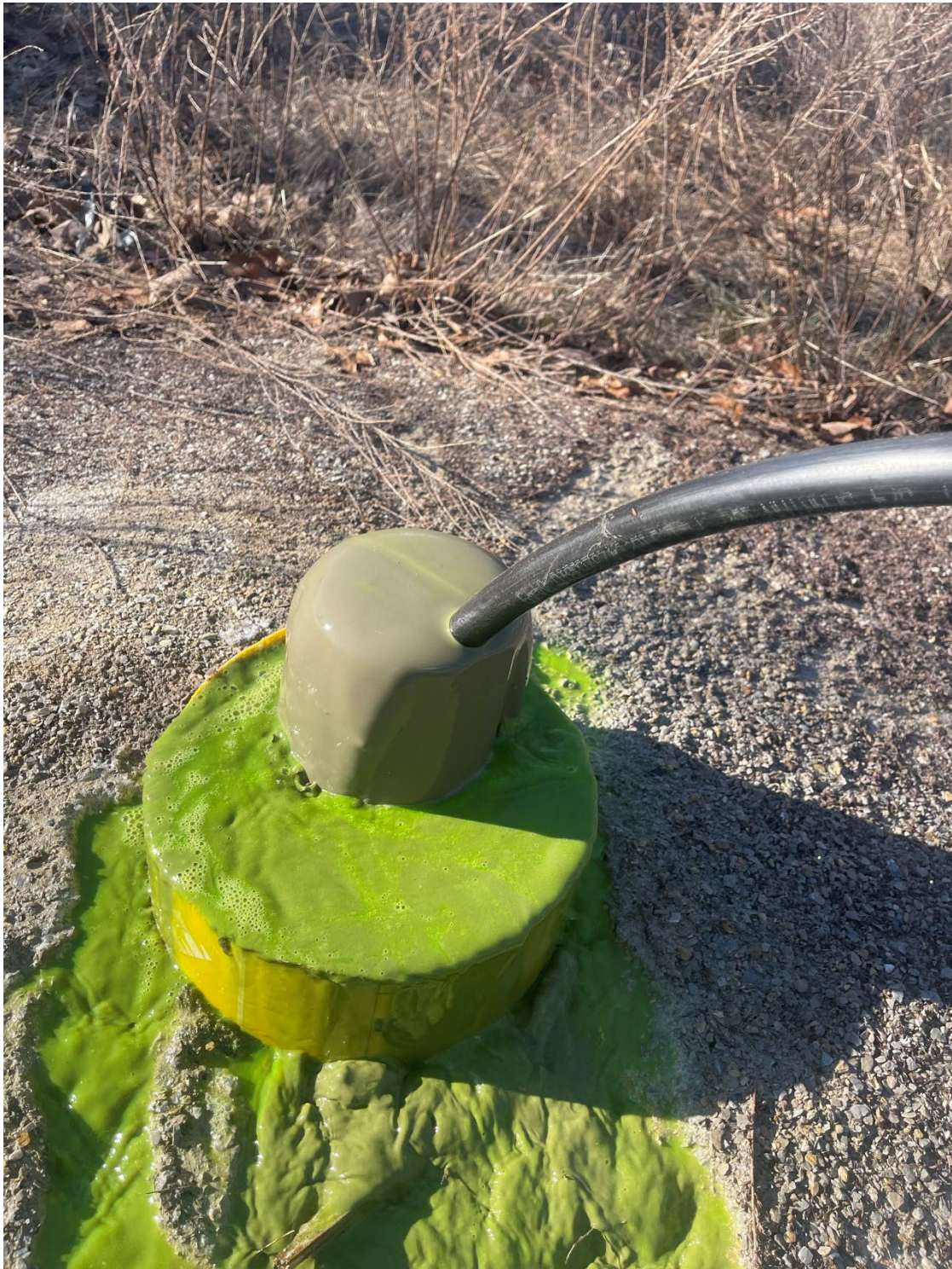
Placing cement to TOC in IW-1