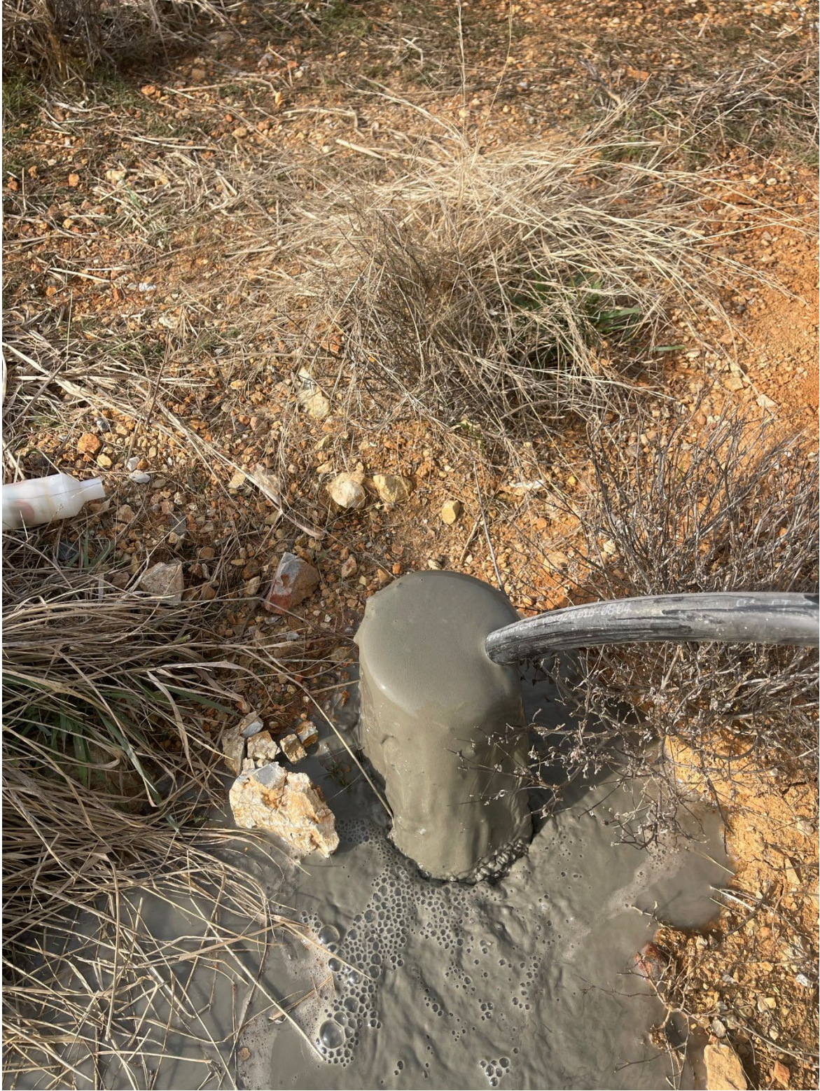
Placing cement to TOC in EB-5