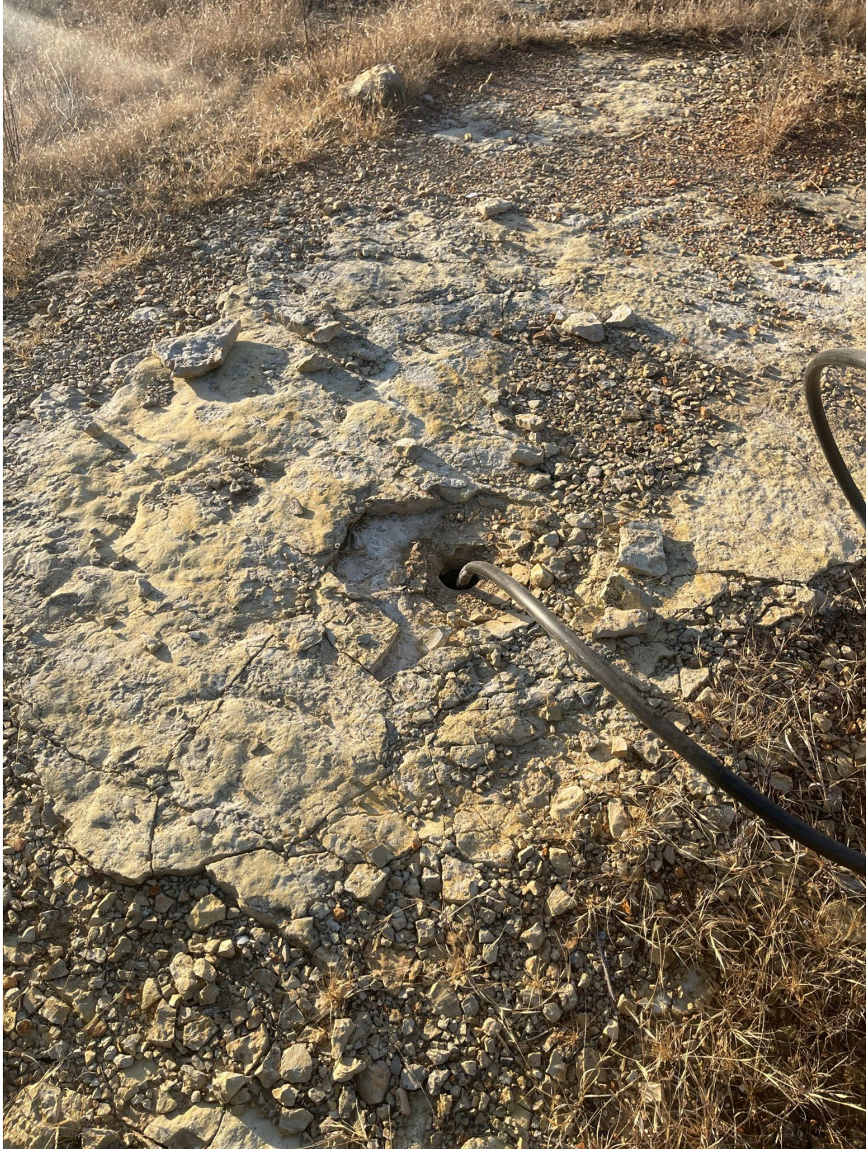
EB-1 with tremie pipe, prior to grouting