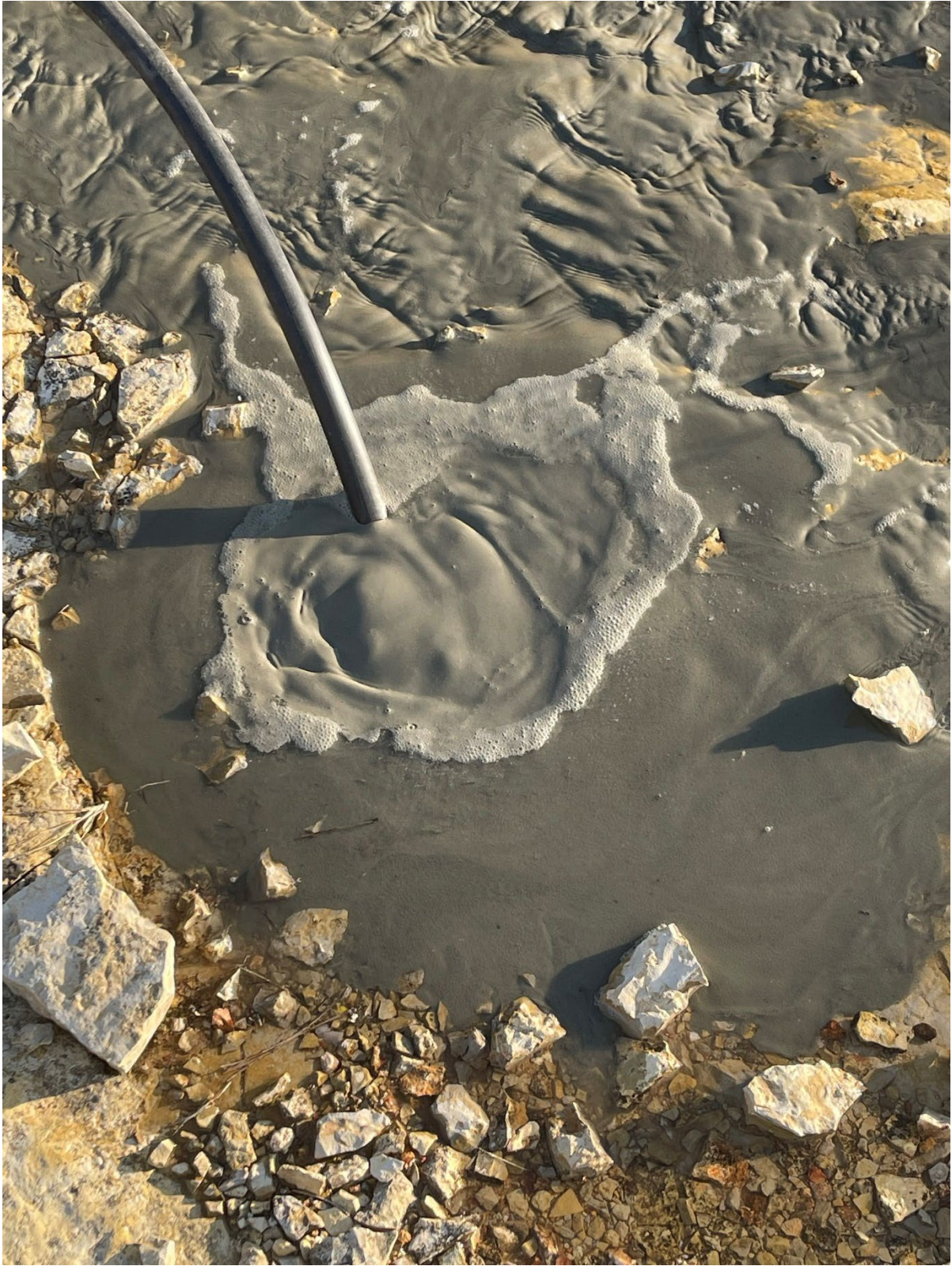
Placing concrete to ground surface in EB-1