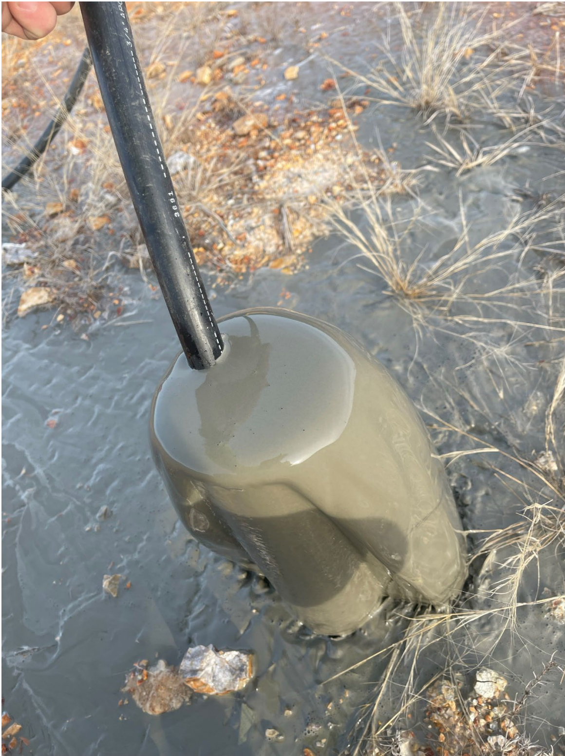
Placing cement to TOC in EB-2