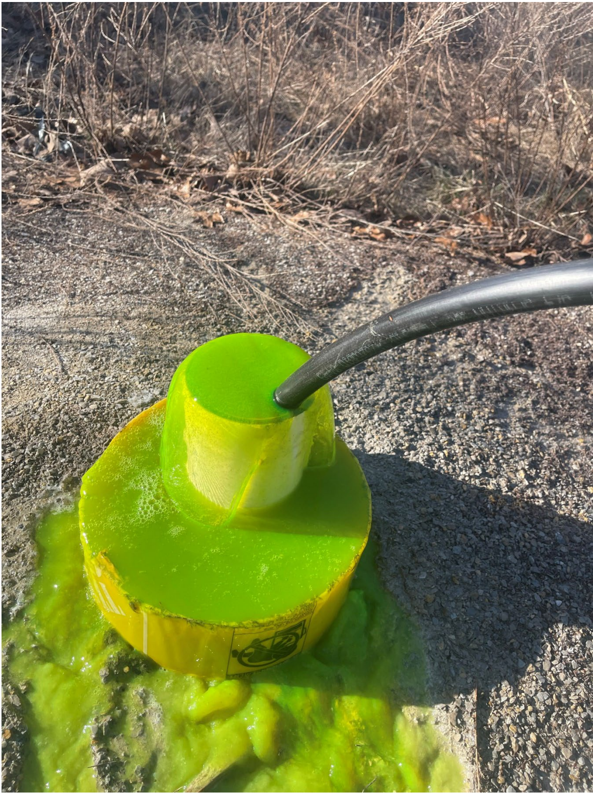
Backfilling IW-1; visible dye (IW-1 was emplacement location for dye test)