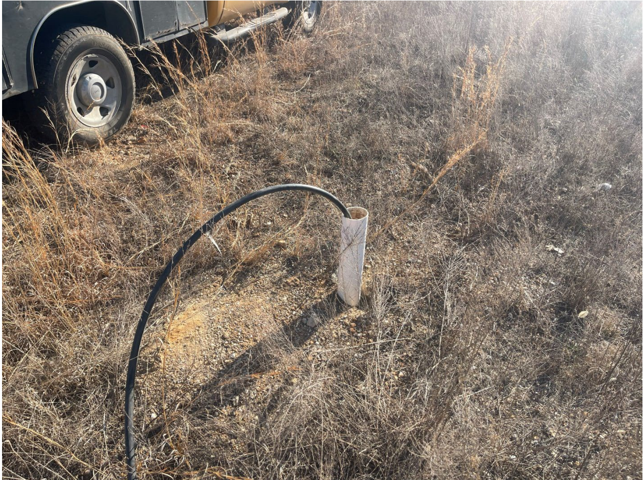
EB-4 with tremie pipe prior to grouting