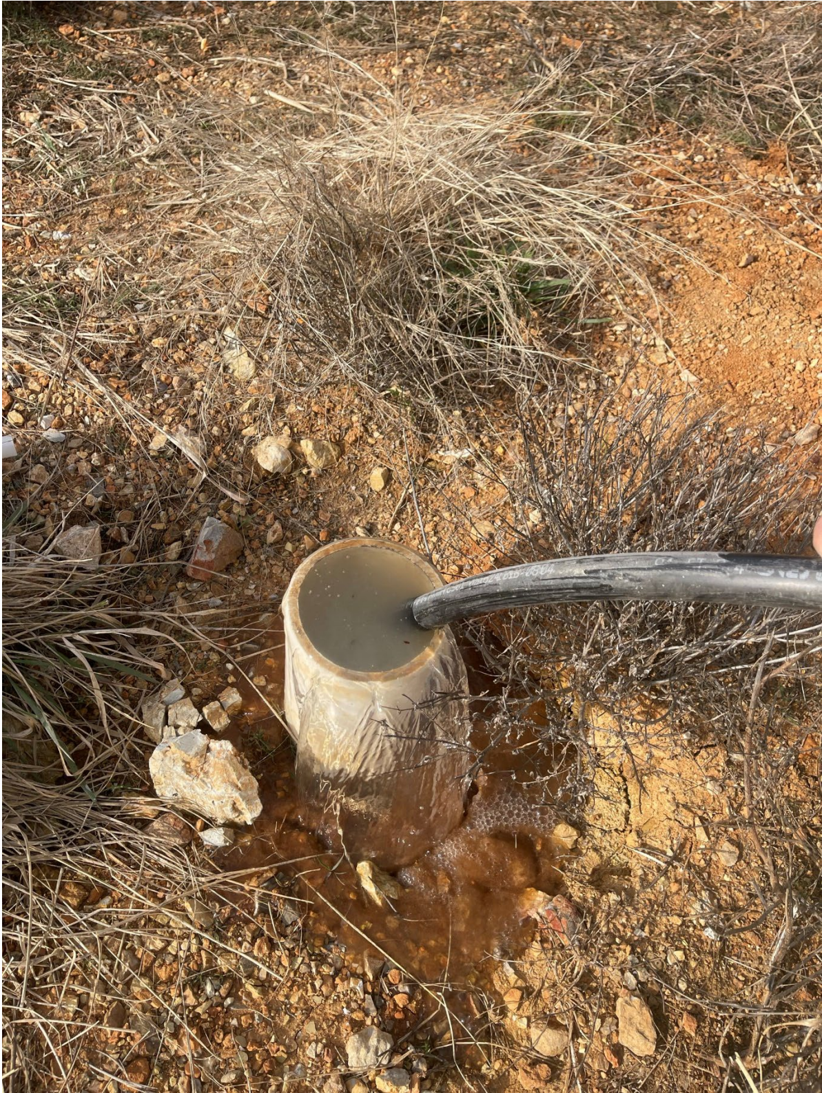
Backfilling EB-5; water rising to top of casing