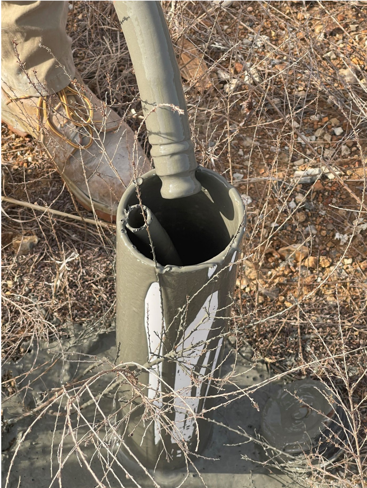
EB-4, backfill complete, prior to top off