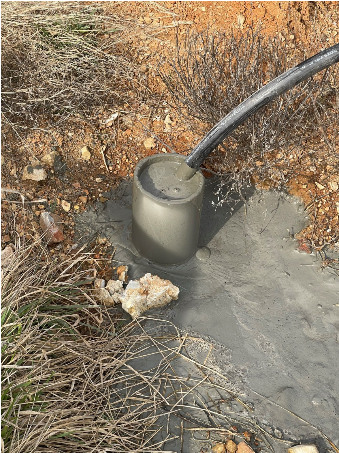
EB-5, backfill complete