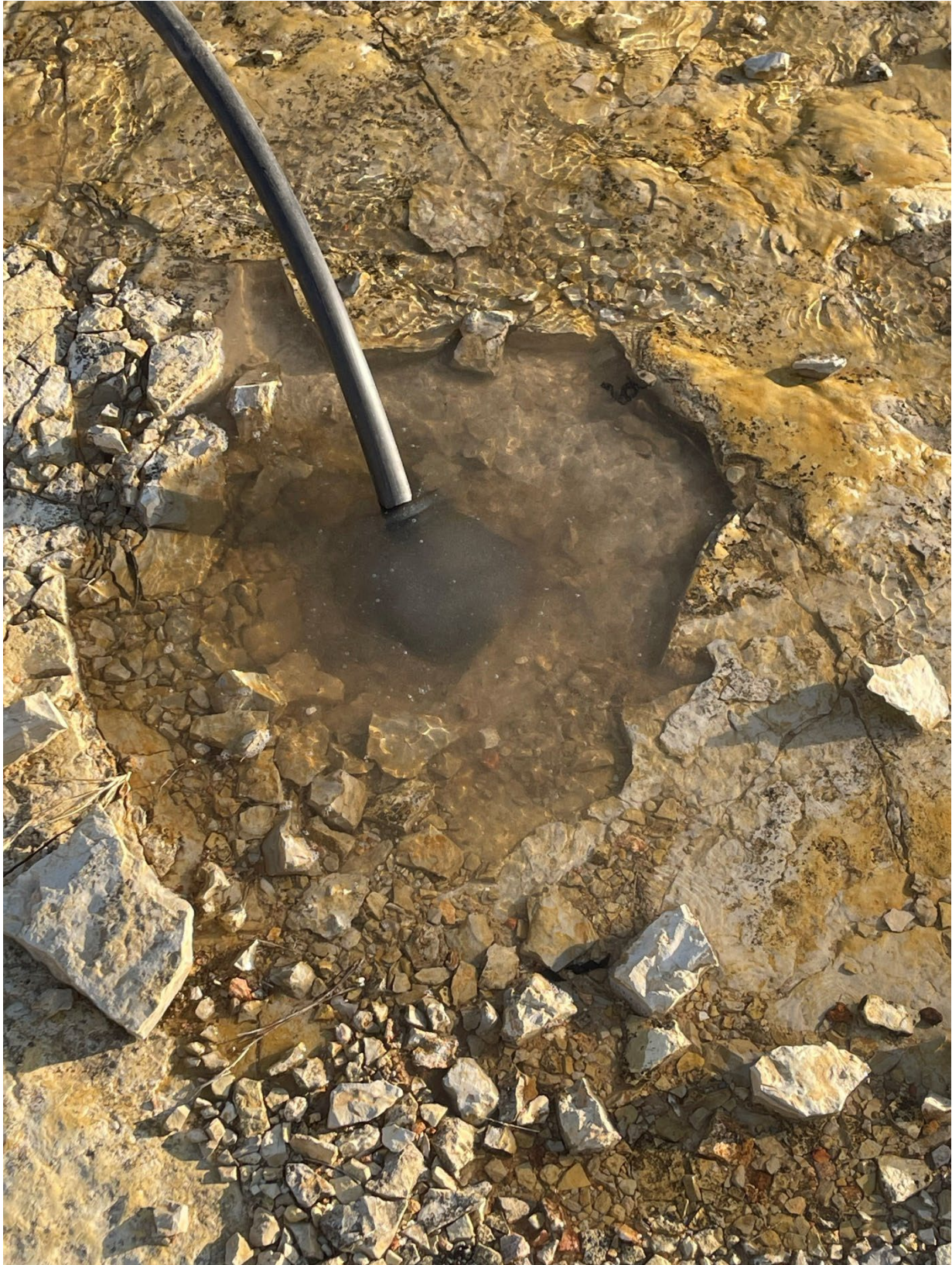
Backfilling EB-1; water rising to top of casing